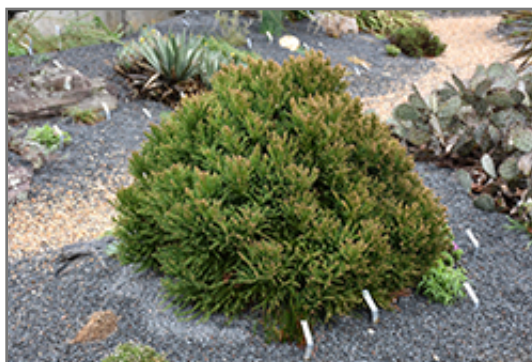
Little Diamond Japanese Cedar

This shrub does best in full sun to partial shade. It prefers to grow in average to moist conditions, and shouldn't be allowed to dry out. It is particular about its soil conditions, with a strong preference for rich, acidic soils, and is able to handle environmental salt. It is quite intolerant of urban pollution, therefore inner city or urban streetside plantings are best avoided, and will benefit from being planted in a relatively sheltered location. Consider applying a thick mulch around the root zone in winter to protect it in exposed locations or colder microclimates. This is a selected variety of a species not originally from North America.