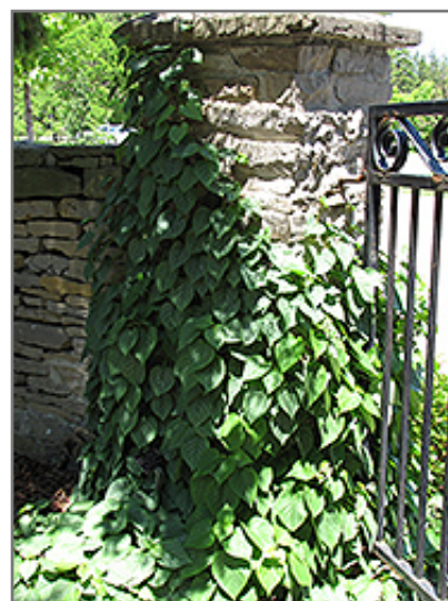
Moonlight Hydrangea Vine