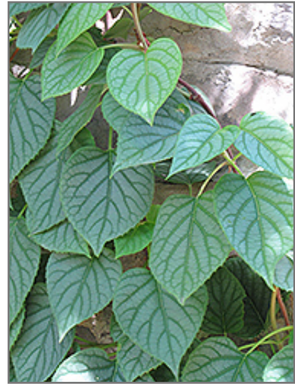
Moonlight Hydrangea Vine foliage

This plant is not reliably hardy in our region, and certain restrictions may apply; contact the store for more information.