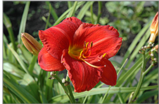
Poinciana Regal Daylily flowers