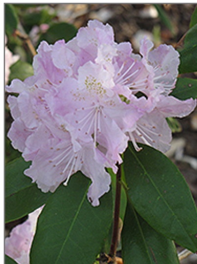
Angel Powder Rhododendron flowers

Angel Powder Rhododendron will grow to be about 5 feet tall at maturity, with a spread of 6 feet. It tends to be a little leggy, with a typical clearance of 1 foot from the ground, and is suitable for planting under power lines. It grows at a slow rate, and under ideal conditions can be expected to live for 40 years or more.