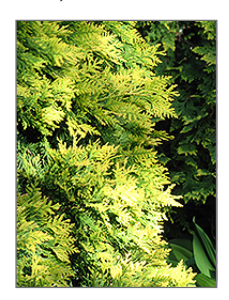
Sudwell's Arborvitae foliage

Sudwell's Arborvitae is recommended for the following landscape applications;