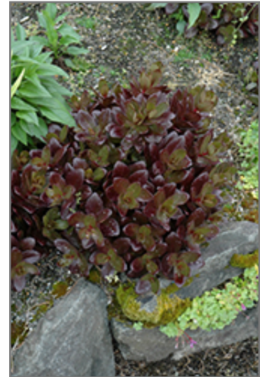
Chocolate Drop Stonecrop

This is a relatively low maintenance plant, and is best cleaned up in early spring before it resumes active growth for the season. It is a good choice for attracting butterflies to your yard, but is not particularly attractive to deer who tend to leave it alone in favor of tastier treats. It has no significant negative characteristics.