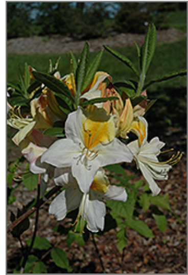
Toucan Azalea flowers

Toucan Azalea will grow to be about 6 feet tall at maturity, with a spread of 8 feet. It tends to be a little leggy, with a typical clearance of 1 foot from the ground, and is suitable for planting under power lines. It grows at a slow rate, and under ideal conditions can be expected to live for 40 years or more.