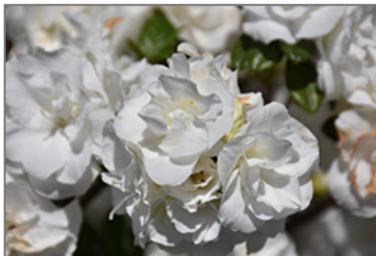
Hardy Gardenia Azalea flowers

Hardy Gardenia Azalea will grow to be about 3 feet tall at maturity, with a spread of 3 feet. It has a low canopy. It grows at a slow rate, and under ideal conditions can be expected to live for 40 years or more.