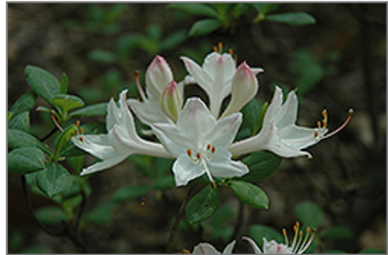
Fragrant Star Azalea flowers

This is a polyploid form of 'Snowbird' and is considered by many to be the most fragrant of azaleas; pure white blooms with dramatic pointed petals cover this shrub in mid spring; must have well drained, acidic, and organic soil