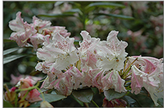
Elie Rhododendron flowers

Elie Rhododendron will grow to be about 5 feet tall at maturity, with a spread of 5 feet. It tends to be a little leggy, with a typical clearance of 1 foot from the ground, and is suitable for planting under power lines. It grows at a slow rate, and under ideal conditions can be expected to live for 40 years or more.