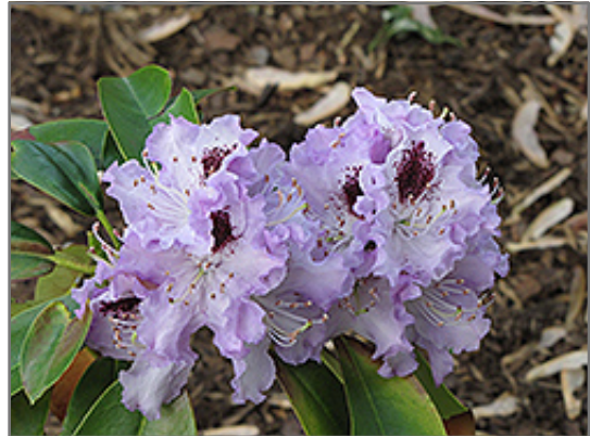
Blue Peter Rhododendron flowers