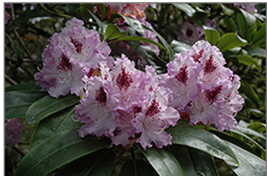
Blue Peter Rhododendron flowers