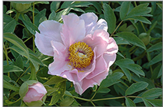
Yukidoro Tree Peony flowers

A lovely peony for the garden, with delicate flowers in a shell pink with violet tones at the eye and prominent yellow stamens, great as an accent in the garden or massed in borders; unlike perennial peonies, remember not to prune this variety