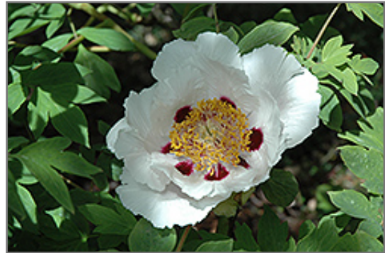
Joseph Rock Tree Peony flowers

Joseph Rock Tree Peony will grow to be about 5 feet tall at maturity, with a spread of 5 feet. It has a low canopy, and is suitable for planting under power lines. It grows at a slow rate, and under ideal conditions can be expected to live for approximately 20 years.