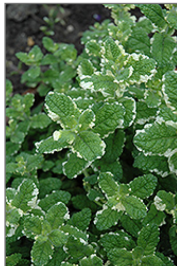
Variegated Pineapple Mint foliage

Variegated Pineapple Mint will grow to be about 18 inches tall at maturity extending to 24 inches tall with the flowers, with a spread of 24 inches. Its foliage tends to remain dense right to the ground, not requiring facer plants in front. Although it's not a true annual, this fast-growing plant can be expected to behave as an annual in our climate if left outdoors over the winter, usually needing replacement the following year. As such, gardeners should take into consideration that it will perform differently than it would in its native habitat.