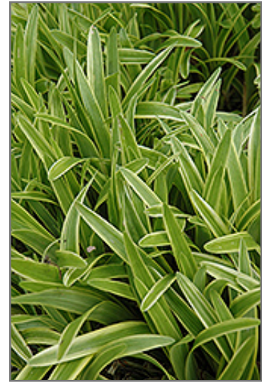
Variegata Lily Turf foliage

This plant is not reliably hardy in our region, and certain restrictions may apply; contact the store for more information.