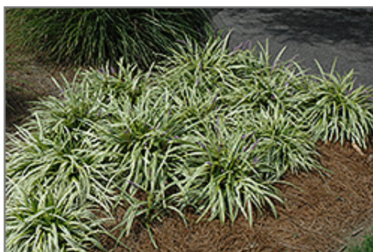
Variegata Lily Turf in bloom