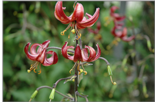
Claude Shride Martagon Lily flowers