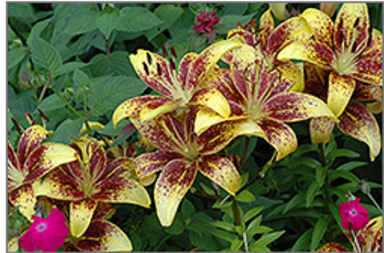
Honey Bee Lily flowers