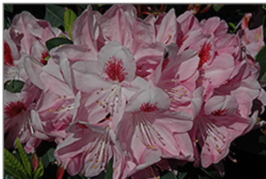
Mrs. Furnival Rhododendron flowers

Pendulous evergreen leaves cover this dense, rounded, slow-growing, but upright shrub; amazing rose-pink flowers with prominent red blotches in midsummer; prefers well-drained, cool, highly acidic and organic soil, use plenty of peat moss when planting