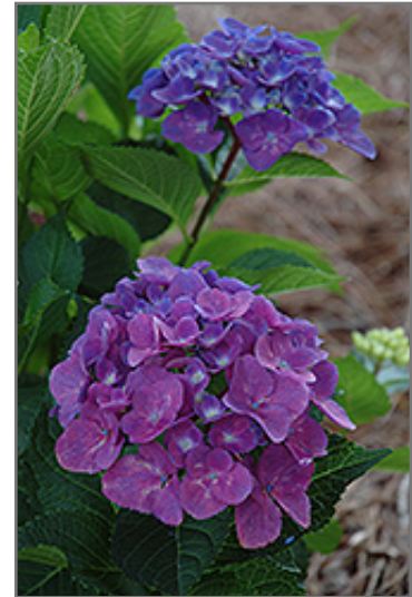
Cityline Venice Dwarf Hydrangea flowers

Cityline Venice Dwarf Hydrangea is recommended for the following landscape applications;