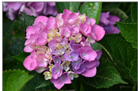
Cityline Venice Dwarf Hydrangea flowers