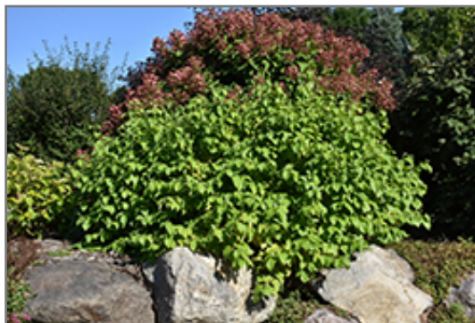
Budd's Yellow Dogwood