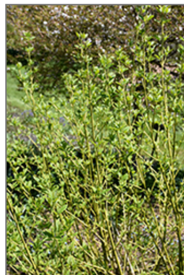
Budd's Yellow Dogwood stems