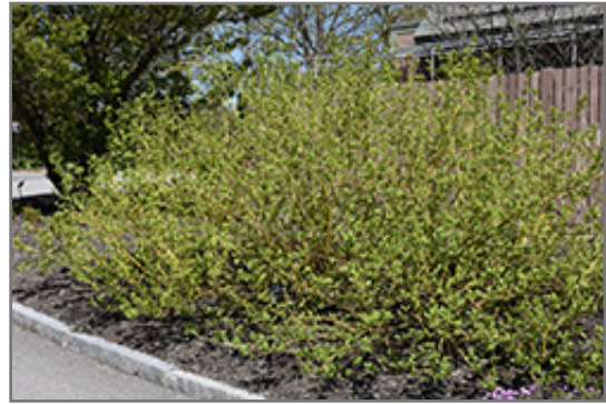
Budd's Yellow Dogwood in spring

This shrub does best in full sun to partial shade. It is an amazingly adaptable plant, tolerating both dry conditions and even some standing water. It is not particular as to soil type or pH. It is highly tolerant of urban pollution and will even thrive in inner city environments. This is a selected variety of a species not originally from North America.