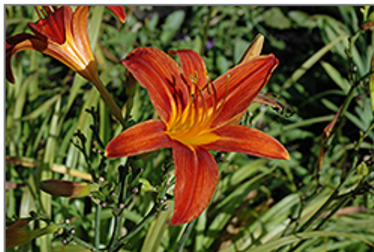
Sammy Russell Daylily flowers