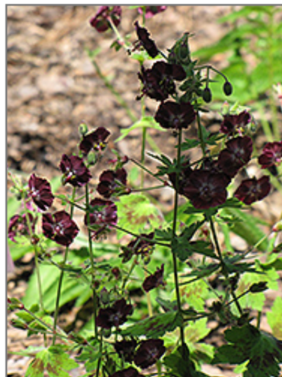
Samobor Cranesbill in bloom

Samobor Cranesbill is recommended for the following landscape applications;