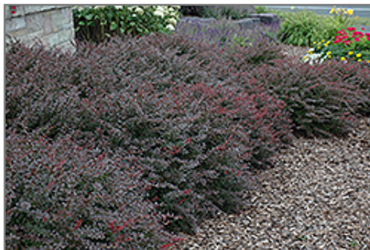
Crimson Pygmy Japanese Barberry

Crimson Pygmy Japanese Barberry will grow to be about 24 inches tall at maturity, with a spread of 3 feet. It tends to fill out right to the ground and therefore doesn't necessarily require facer plants in front. It grows at a medium rate, and under ideal conditions can be expected to live for approximately 20 years.