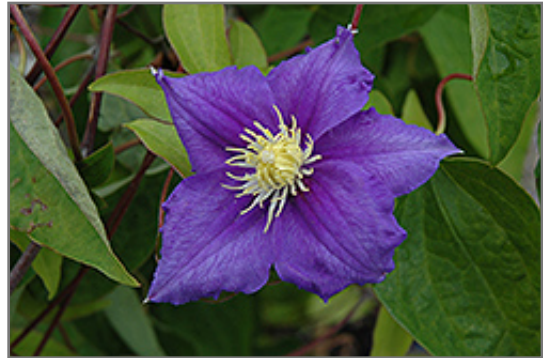
Will Goodwin Clematis flowers