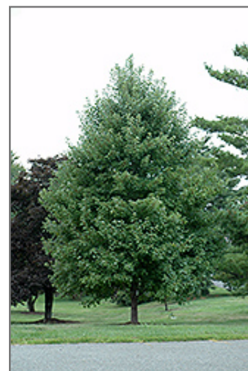
October Glory Red Maple