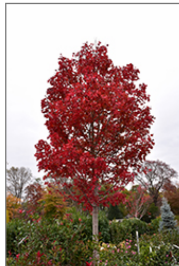
October Glory Red Maple in fall