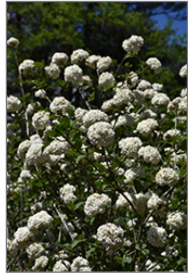
Fragrant Viburnum flowers

This plant is not reliably hardy in our region, and certain restrictions may apply; contact the store for more information.