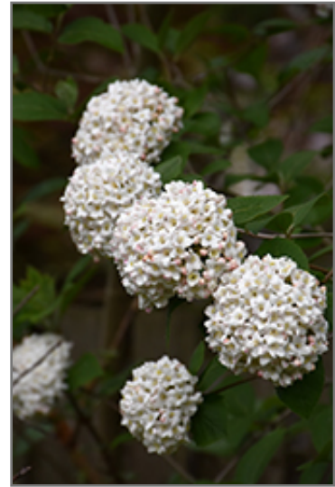
Fragrant Viburnum flowers

Fragrant Viburnum is recommended for the following landscape applications;