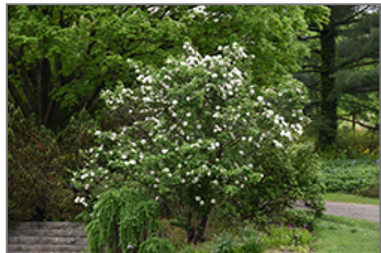
Fragrant Viburnum in bloom