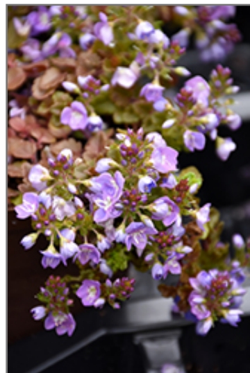
Crystal River Speedwell flowers

This plant is not reliably hardy in our region, and certain restrictions may apply; contact the store for more information.