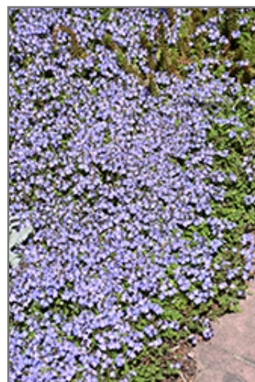
Crystal River Speedwell in bloom