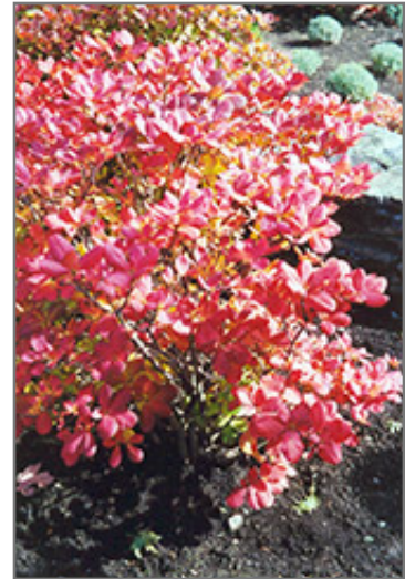
Royal Azalea in fall

This plant is not reliably hardy in our region, and certain restrictions may apply; contact the store for more information.