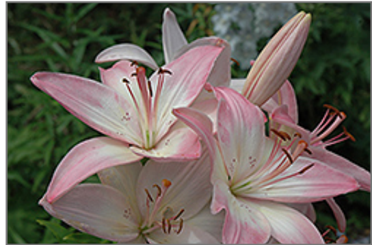
Marlene Lily flowers