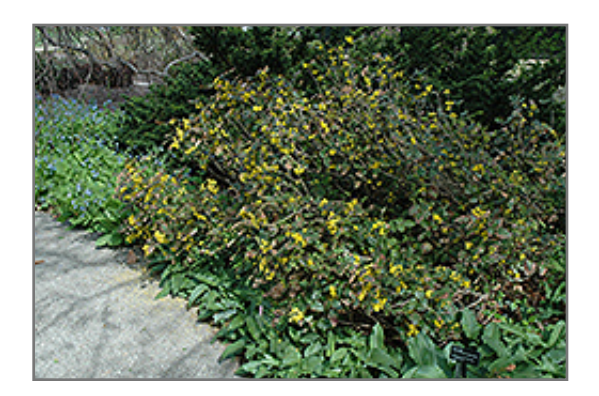
New Market Oregon Grape in bloom

This is a high maintenance shrub that will require regular care and upkeep, and can be pruned at anytime. It is a good choice for attracting birds to your yard, but is not particularly attractive to deer who tend to leave it alone in favor of tastier treats. Gardeners should be aware of the following characteristic(s) that may warrant special consideration;