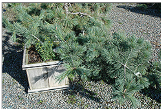
Weeping Blue Limber Pine