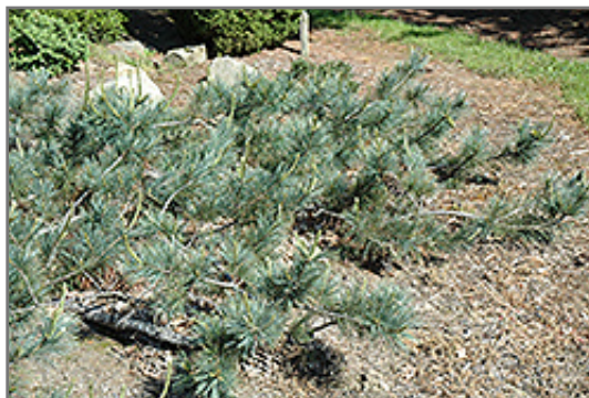
Weeping Blue Limber Pine

Weeping Blue Limber Pine will grow to be about 24 inches tall at maturity, with a spread of 8 feet. It tends to fill out right to the ground and therefore doesn't necessarily require facer plants in front. It grows at a slow rate, and under ideal conditions can be expected to live for 80 years or more.