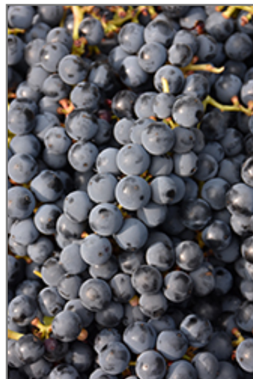
Steuben Grape fruit