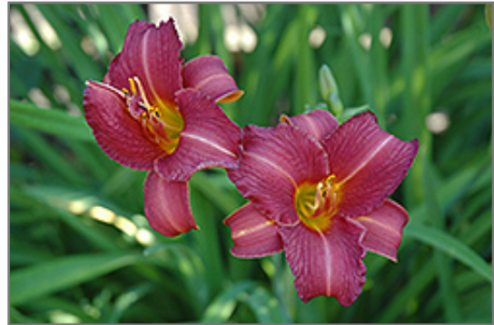
Violet Light Daylily flowers