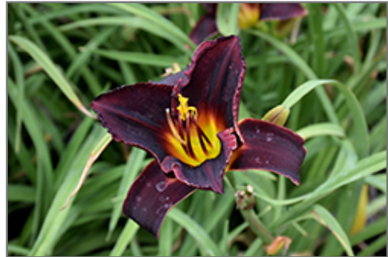
Salieri Daylily flowers