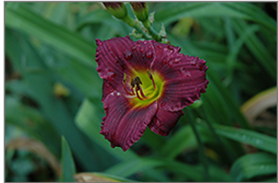
Minstrel Boy Daylily flowers