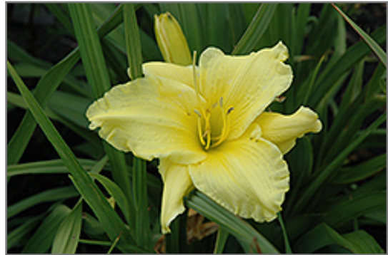
Irish Whim Daylily flowers