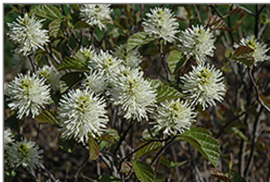
Red Monarch Fothergilla flowers