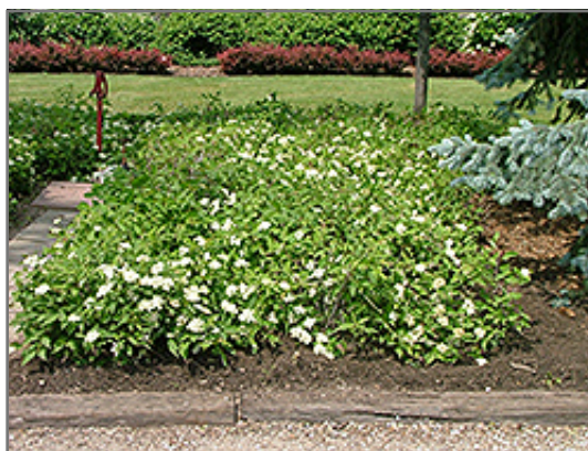
Muskingum Gray Dogwood in bloom