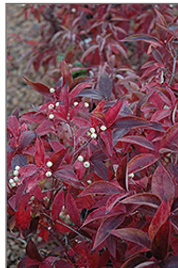
Muskingum Gray Dogwood in fall

Muskingum Gray Dogwood is recommended for the following landscape applications;