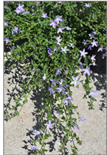
Blue Waterfall Serbian Bellflower in bloom