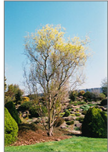
Dragon's Claw Willow in winter

Dragon's Claw Willow will grow to be about 30 feet tall at maturity, with a spread of 25 feet. It has a low canopy with a typical clearance of 2 feet from the ground, and should not be planted underneath power lines. It grows at a fast rate, and under ideal conditions can be expected to live for 40 years or more.