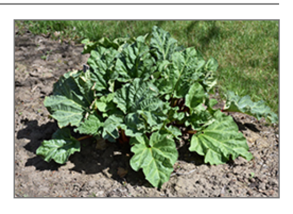
Chipman Red Rhubarb

This is an herbaceous perennial with a rigidly upright and towering form. Its wonderfully bold, coarse texture can be very effective in a balanced garden composition. This plant will require occasional maintenance and upkeep, and can be pruned at anytime. Deer don't particularly care for this plant and will usually leave it alone in favor of tastier treats. It has no significant negative characteristics.