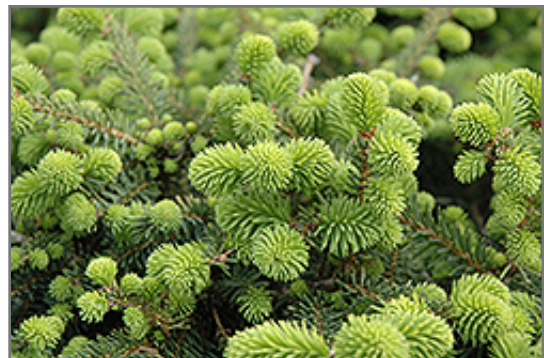
Creeping Norway Spruce foliage