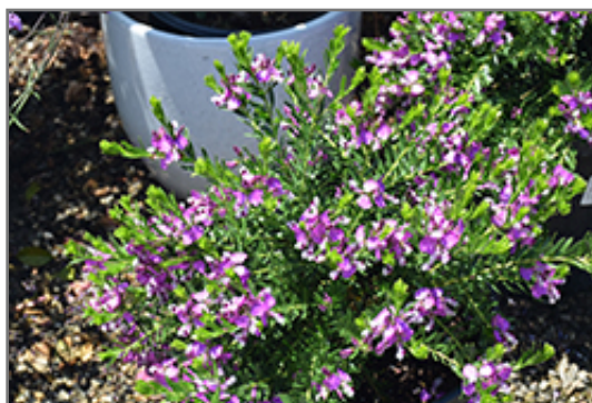
Purple Broom in bloom