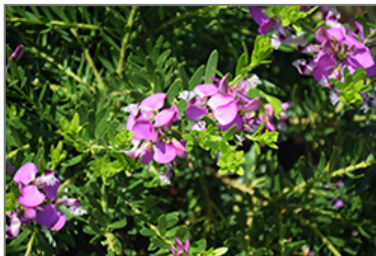
Purple Broom flowers