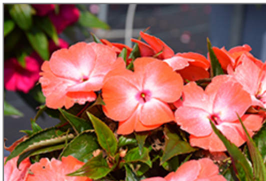
Petticoat Orange Orchid New Guinea Impatiens flowers