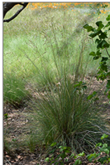
California Fescue