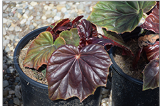
Red Fred Begonia foliage

Red Fred Begonia is recommended for the following landscape applications;