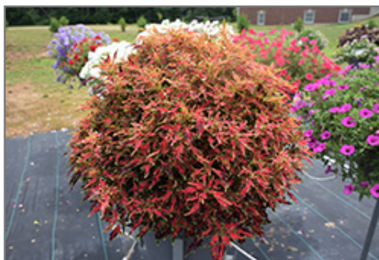
ColorBlaze Mini Me Watermelon Coleus