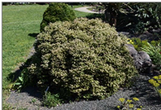
Darrow's Blueberry in bloom

This is a multi-stemmed evergreen shrub with a mounded form. Its average texture blends into the landscape, but can be balanced by one or two finer or coarser trees or shrubs for an effective composition. This is a relatively low maintenance plant, and usually looks its best without pruning, although it will tolerate pruning. It is a good choice for attracting birds to your yard. It has no significant negative characteristics.