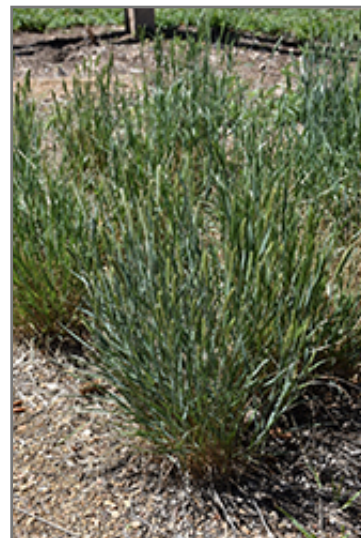
Crested Wheat Grass