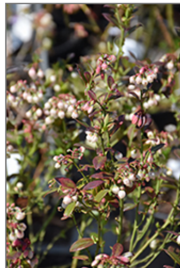
Buckle Blueberry flowers

Aside from its primary use as an edible, Buckle Blueberry is suitable for the following landscape applications;